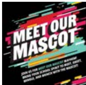
28 Meet Our Mascot