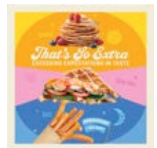
23 That's So Extra