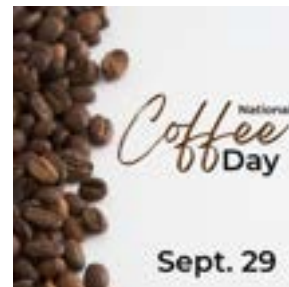
29 National Coffee Day