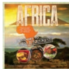
10 Global Street Foods Africa