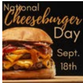
18 National Cheeseburger Day